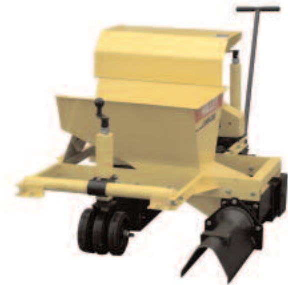
MC655 under guard rail curber with offset auger housing