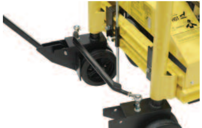
Steering handle, brake, tie rod and pointer arm