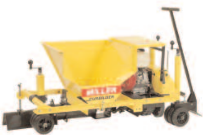
MC Series Curbuilder™

Miller MC Curbuilders™ have offered unequaled performance and versatility for over 40 years. These simple and efficient machines continue to provide the most economical method available of placing free standing, high-density extruded curb from either concrete or asphalt.